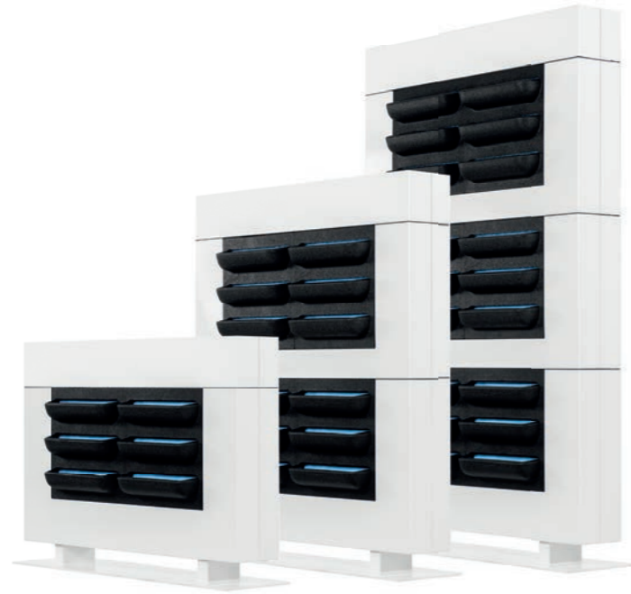
LiveDivider PLUS 1 LiveDivider PLUS 2 LiveDivider PLUS 3